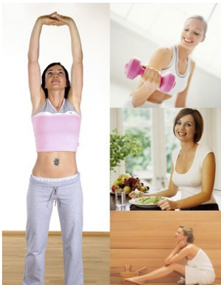
Life Proof Makeup