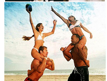
Water, sweat, tear & activity resistant